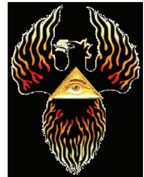
Information from Phoenixmasonry.org Great Resource!