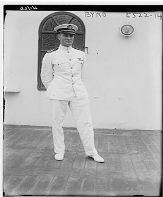
Admiral and Brother Richard E. Byrd