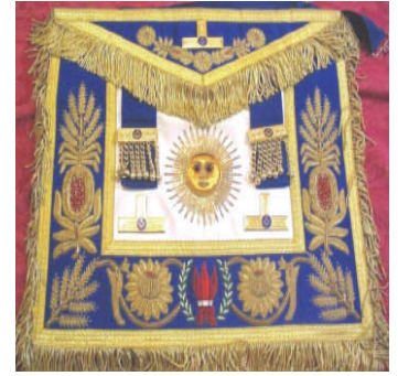
G.M. APRON FROM WESTERN AUSTRALIA