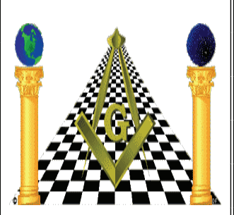
Support YOUR Lodge

Believe me when I tell you that they were simply looking to make sure that I WAS a Master Mason and could prove it. Not only by being in possession of my Dues Card (which I had) but by being able to provide them with the information they were actually seeking. It was not difficult, and I had a GREAT time. I hope many Brothers will come BACK.