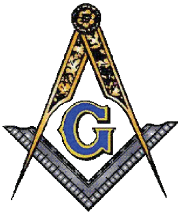
The Letter G

In the Lodge room it is always visible in the East, either painted on the wall or sculptured in wood or metal, and suspended over the Master's chair. Psalms 103:11-22 - Psalms 8:3-9 - Ex. 20:22