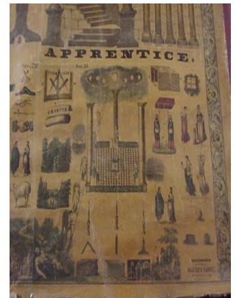
Sherer's Carpets Once used to assist In giving lectures