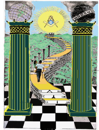
The winding stairs...

being a Mason, I have never heard lectures delivered in the manner in which these Brothers do. They don't just "give" the lecture, they become a part of the work. If you haven't heard a first or second degree lecture lately, I would encourage you to come on out to the Lodge. You won't be disappointed!!