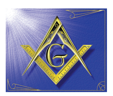
Support YOUR Lodge

I hope we will be back on track during the coming months and it looks like July will be an extremely busy month. I would urge everyone to come out and join us in the fellowship and welcome our new Brothers into the greatest fraternity in the world. Until next month, God Bless. Bro. Bosie