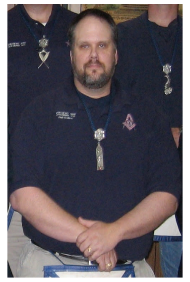
The Junior Warden Beauty to adorn...