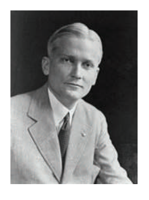
Bro. Hiram Bingham, III Discovered the ancient city of Machu Picchu in Peru.