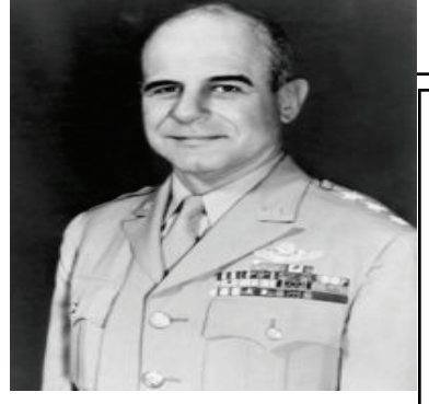
BRO. and GENERAL J.H. "JIMMY" DOOLITTLE