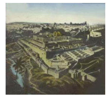
King Solomon's Temple