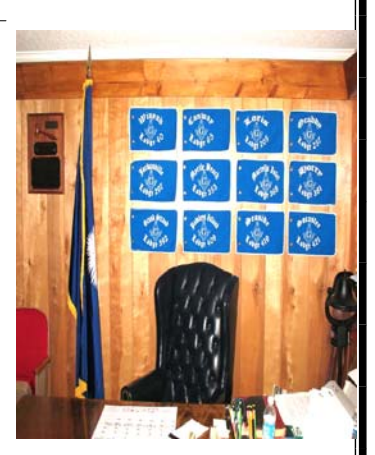
LODGE FLAGS AT PAWLEY'S ISLAND

This took a good a great deal of coordination and planning to get this accomplished. These Brothers work together in Harmony for the Good of the Order, and for their Lodge in particular. Congratulations to our Brothers at Pawley's Island # 409!!!