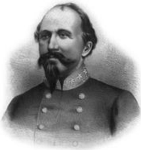
Bro. John Hunt Morgan Confederate General Best known for historic “Morgan’s Raid”