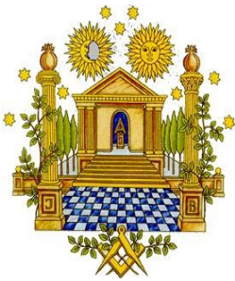
Symbols of Masonry Light from Above Spreading over the Globe