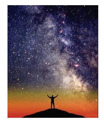
The study of the celestial bodies...