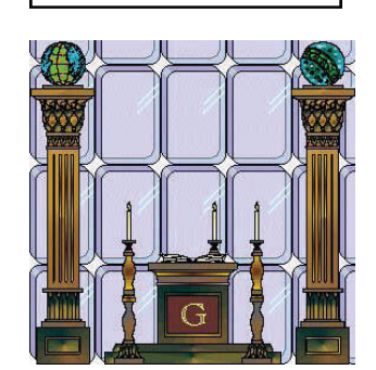
ON THE WEB WWW.PACIFIC325.ORG