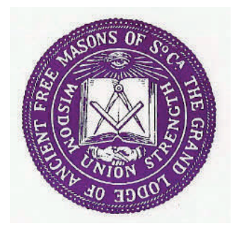
Support YOUR Lodge and YOUR Grand Lodge

Remember, YOU are Grand Lodge. They cannot exist without us nor can we exist without them. It is our duty to attend and to vote the will of Pacific Lodge. I hope some will able to make it.