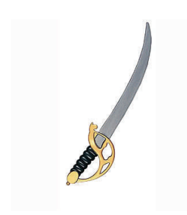
The Implement of his office Tiler or Outer Guard