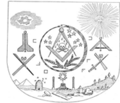
Apron with Masonic Symbols

http://en.wikipedia.org/wiki/Masonic_bodies