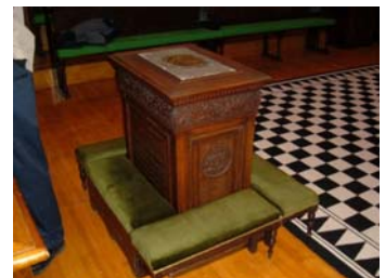
Altar & checkered floor