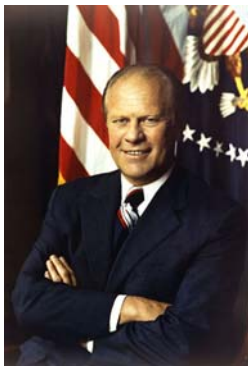
Gerald Ford U.S. President, 33°. Malta Lodge No. 465, Grand Rapids, MI