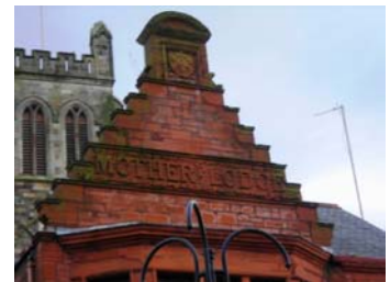
Edifice of Kilwinning # 0

Note: The S.C. delegation was lucky enough to visit this Lodge in our recent journey.