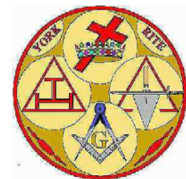
York Rite Bodies