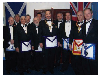
S.C. Brothers in Scotland