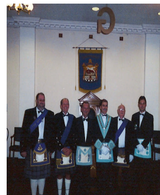
English Brothers in Luton