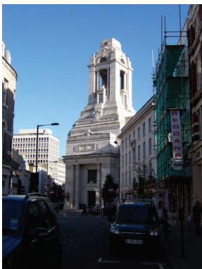
GRAND LODGE OF ENGLAND

9 BROTHERS FROM THE U.K. WILL JOIN US FOR GRAND LODGE AND TO VISIT PACIFIC 325. COME MEET AND WELCOME YOUR BROTHERS!