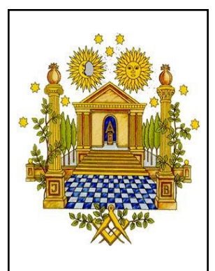
Symbols of Masonry Light from Above Spreading over the Globe