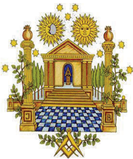
Symbols of Masonry Light from Above Spreading over the Globe