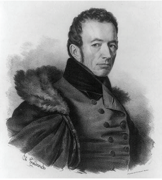
Bro. Joel Roberts Poinsett 15th Secretary of War Serving under President Martin Van Buren In office March 7, 1837 – March 5, 1841