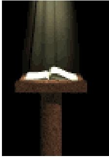
Chaplain... Invoke the blessing of the Diety