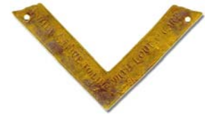
Wisdom to Contrive

As I mentioned on page one, this promises to be a VERY busy year for Pacific and there should be plenty of work to go around for everyone. I know everyone is looking forward to another productive year for our Lodge.