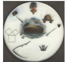
Support YOUR Lodge

Come on out and see us when you can. It looks like we should have work EVERY week in February. Anyone needing a ride or assistance, please feel free to call me. If I can't take your call, please leave me a message. My home number is 787-1979 and my cell is 960-9136.