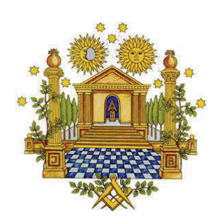
Support YOUR Lodge

Keep up the good work. I am looking forward to our new members and the resurgence of work within the Lodge. Come out and join us and pitch in when you can. We can always use a hand SOMEWHERE in the Lodge. Cheers! Bro. Bosie