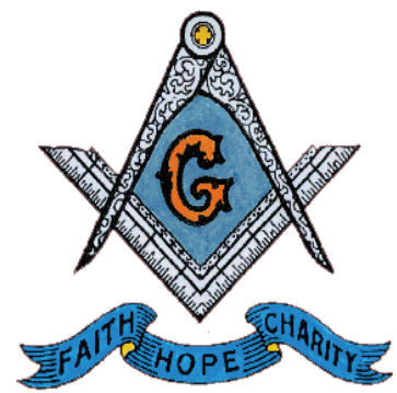
Symbolism within the Lodge The Square and Compasses