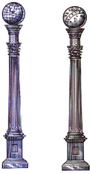
THE TWO PILLARS