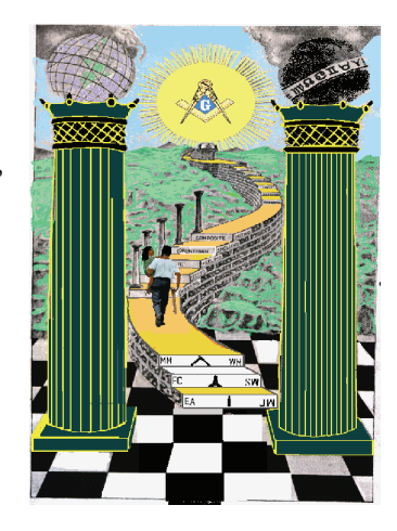
The winding stairs...