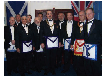
S.C. Brothers in Scotland