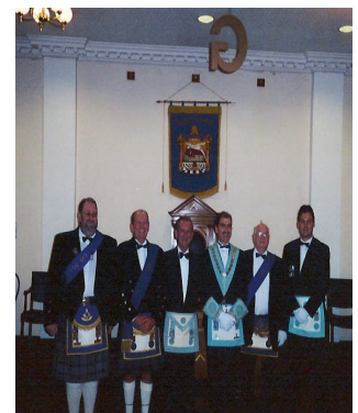
English Brothers in Luton