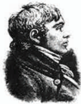
ROBERT MILLS AMERICA'S FIRST ARCHITECT

Some people refer to a “senior” or “junior” Steward, however that is not the case. There is what is known as a “talking steward”, but both are equal in Masonic “Rank” so to speak. Thanks for all your help this year and we look forward to many more evenings together..