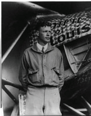
Brother Charles Lindbergh with the Spirit of St. Louis