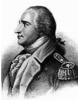
Perhaps one of the most notable traitors

Benedict Arnold V (January 3, 1740 – June 14, 1801) was a general during the American Revolutionary War. He began the war in the Continental Army but later defected to the British Army. While he was still a general on the American side, he obtained command of the fort at West Point, New York, and plotted unsuccessfully to surrender it to the British. After the plot was exposed in September 1780, he entered the British Army as a brigadier general.