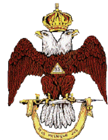
Ask how YOU can become a Scottish Rite Mason!