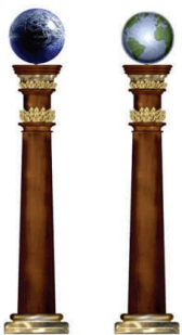
Pillars of Masonry