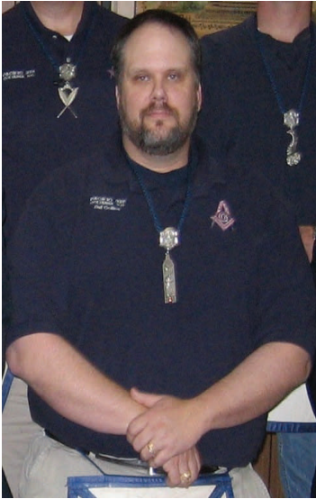
The Junior Warden Beauty to adorn...