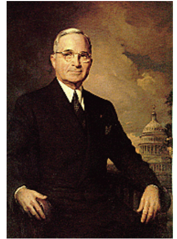
M.W. Bro. and President Harry S. Truman

sumption of the office of President in my own right." It became known as the Fair Deal. Dangers and crises marked the foreign scene as Truman campaigned successfully in 1948. In foreign affairs he was already providing his most effective leadership. In 1947 as the Soviet Union pressured Turkey and, through guerrillas, threatened to take over Greece, he asked Congress to aid the two countries, enunciating the program that bears his name--the Truman Doctrine. The Marshall Plan, named for his Secretary of State, stimulated spectacular economic recovery in war-torn western Europe. When the Russians blockaded the western sectors of Berlin in 1948, Truman created a massive airlift to supply Berliners until the Russians backed down. Meanwhile, he was negotiating a military alliance to protect Western nations, N.A.T.O., established in 1949. M.W. Bro. Truman died December 26, 1972 at the age of 88.