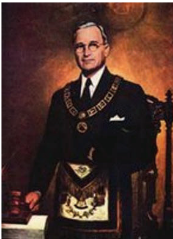
W.M. Bro. Harry S. Truman