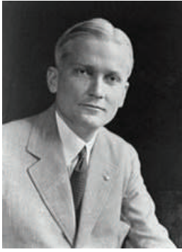
Bro. Hiram Bingham, III Discovered the ancient city of Machu Picchu in Peru.