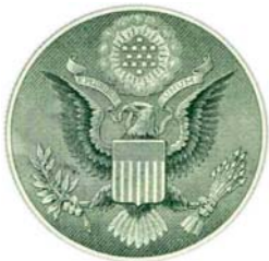
GREAT SEAL of the UNITED STATES of AMERICA