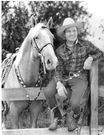
Ill. Bro. Gene Autry, 33°, Grand Cross And his horse CHAMPION