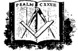
Entered Apprentice Degree First Degree Verse

The Masonic degree verse of the Entered Apprentice Degree represents Youth, when the body is strong. Those who walk in the ways of the LORD are rewarded the blessing of eternal life.