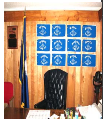
LODGE FLAGS AT PAWLEY'S ISLAND

This took a good a great deal of coordination and planning to get this accomplished. These Brothers work together in Harmony for the Good of the Order, and for their Lodge in particular. Congratulations to our Brothers at Pawley's Island # 409!!!