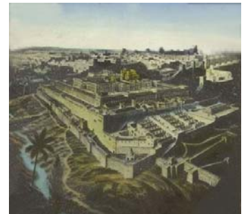
King Solomon's Temple