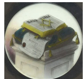
Holy Bible, Square & Compass