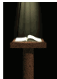
The Great Light