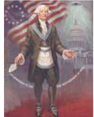
President and Brother George Washington

Washington was initiated, in 1752, in the Lodge at Fredericksburg, Virginia, and the records of that Lodge, still in existence. The first entry is thus: "Nov. 4th. 1752. This evening Mr. George Washington was initiated as an entered Apprentice", receipt of the entrance fee, amounting to £2 3s., was acknowledged.