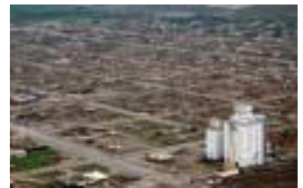
Photos of aftermath in Greensburg, KS

One request for assistance resulted in a contribution of just over $ 300 in ONE NIGHT. That was just from the Brothers present at the meeting. The lodge also agreed to send an additional $ 200 from the Charity Fund to make the total slightly more than $ 500 from Pacific Lodge. Keep these folks in your prayers and thanks for your generosity.