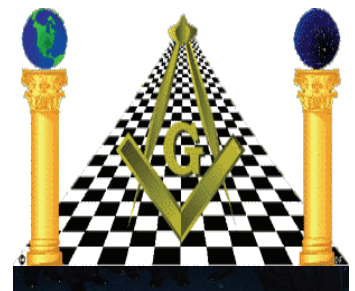
Support YOUR Lodge

We offer thanks to EVERYONE who helps out and makes "IT" happen, working in the spirit of the fraternity and for the Good of the Order.