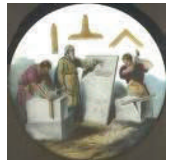
Three Principle Supports