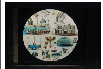
Emblems of the Craft Symbols of Masonry