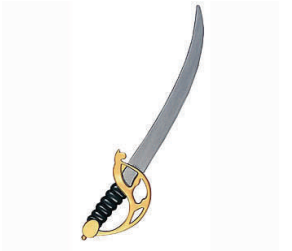
The Implement of his office Tiler or Outer Guard