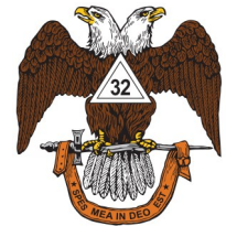
AASR - Scottish Rite