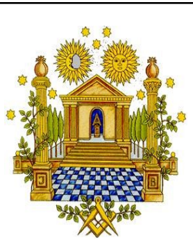
Symbols of Masonry Light from Above Spreading over the Globe