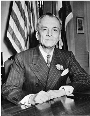
Most Worshipful Brother Manuel Luis Quezon y Molina