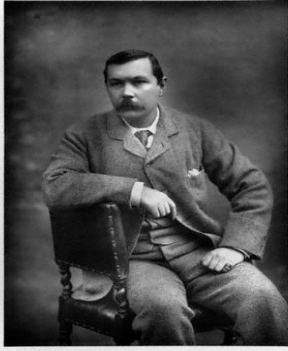
Portrait of Sir Arthur Conan Doyle