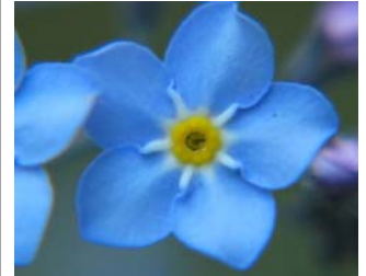
The Forget-Me-Not A symbol of Masonry