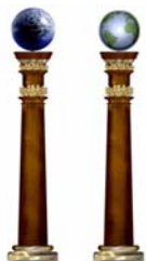
The Pillars of King Solomon