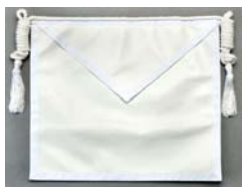
An emblem of innocence and the badge of a Mason.