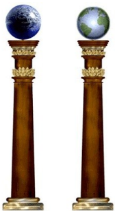
Pillars of Masonry