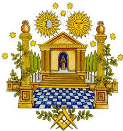
Symbols of Masonry Light from Above