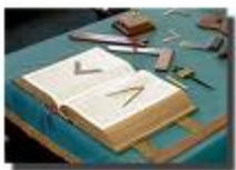
Volume of Sacred Law

My Brothers, as we approach the coming election (Nov. 2) I thought this piece from Phoenixmasonry was most timely. While I am not herein supporting or endorsing any candidate, I DO urge each and every Brother to perform your Civic DUTY and cast your vote. Remember, if you don't participate and vote, you have no right to complain. May the best candidate win and may they be guided in their leadership by the Great Architect of the Universe.