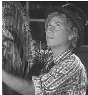
Bro. Harpo in A Night at the Opera (1935)

We are proud to have you with us at Pacific, Worshipful!